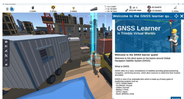
GNSS Learner Quest in Virtual World